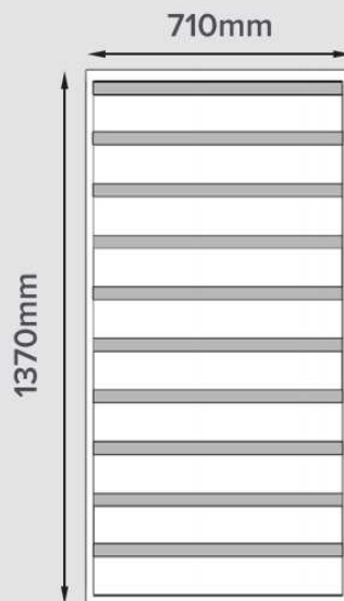
TEN DRAWER CABINET