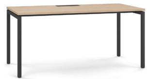
Nitron - U Shape