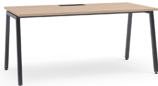
Astris - A Shape