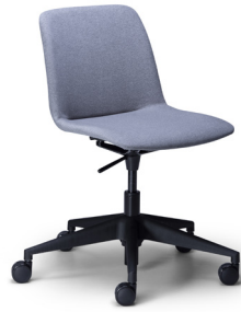
5 Way Swivel Height Adjustable