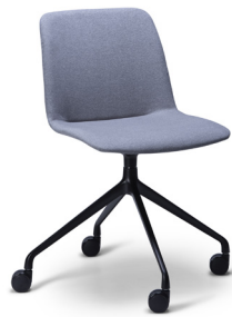
4 Way Swivel Fixed Height