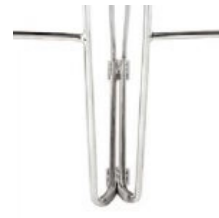
Connectors for Sled