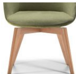
Timber Base Oak Stain