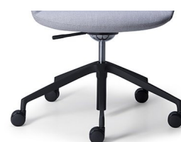
5 Way Swivel