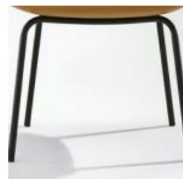
4 Leg Metal Frame