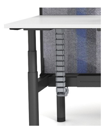
Rollar - Round Leg Profile