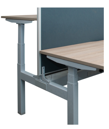
Matrix - Rectangle Leg Profile