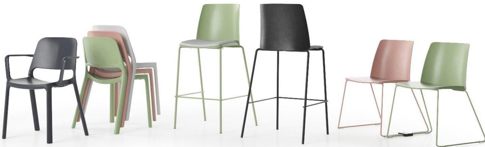
MONO – O