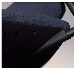
Under Seat Cover