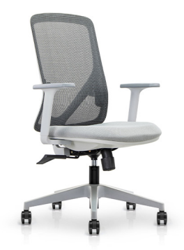
White/Grey Task Chair