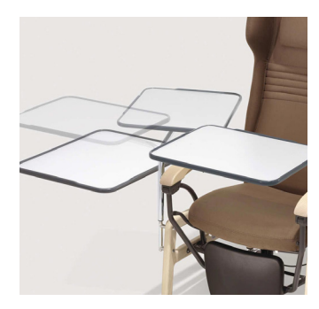
Adjustable Swivel Tray