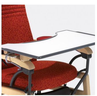
Push on Swivel Tray