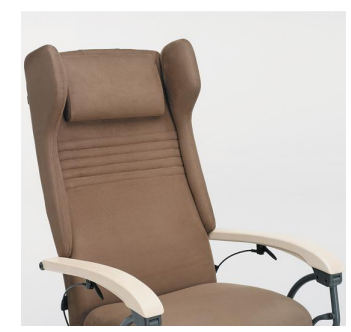
Side Wings / Headrest